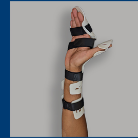
DORSAL BLOCK WITH THUMB