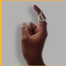
ANTI SWAN-NECK SPLINT