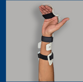
DORSAL BLOCK WITHOUT THUMB